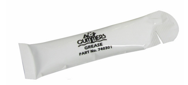
Silicon Grease - SP-495-0002